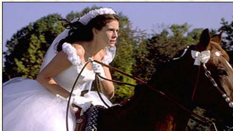
The 1999 movie, 'Runaway Bride' starred Julia Roberts.

SOME GOOD NEWS FOR THE BRIDE OF CHRIST AS SHE CONTEMPLATES THE "FINAL WITNESS". THE HOLY SPIRIT WILL BE WITH US!