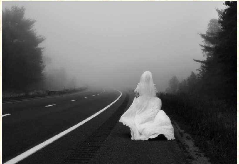
Click on the image above to go to her website.

Here we are, camped out once more, by the rivers of Babylon. And our harps hang in the willows, as they did long ago. We remember, and we long for, a Holy City yet unseen.