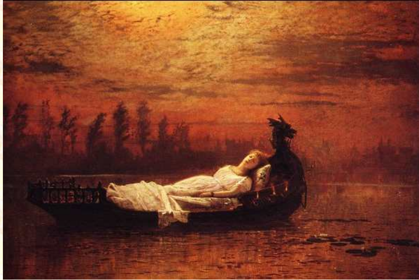
Painting by John Grimshaw

Click here to go to the John Grimshaw Gallery.